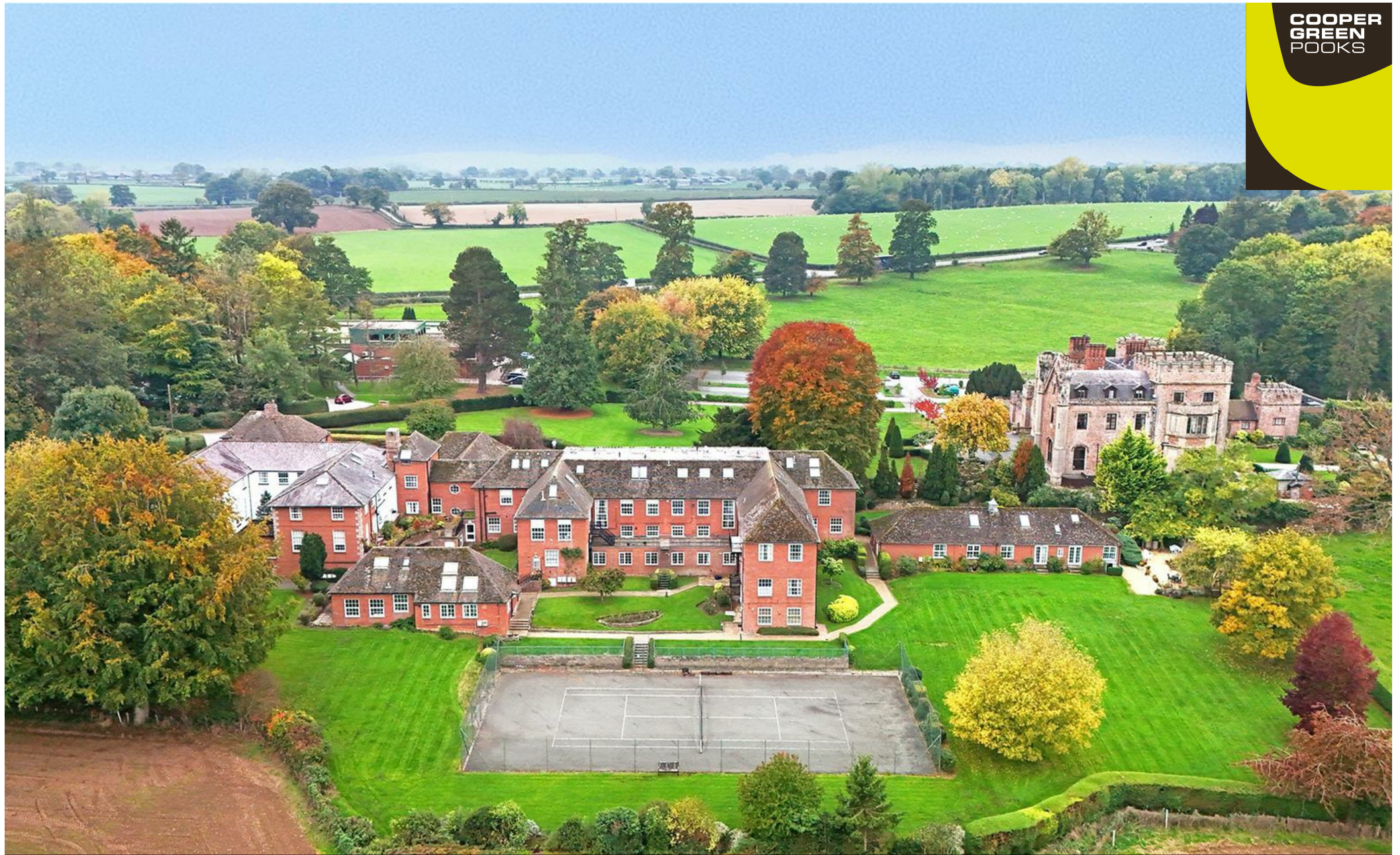
Apartment N, Rowton Court, Rowton, Shrewsbury, SY5 9EP £1,000 Per Month